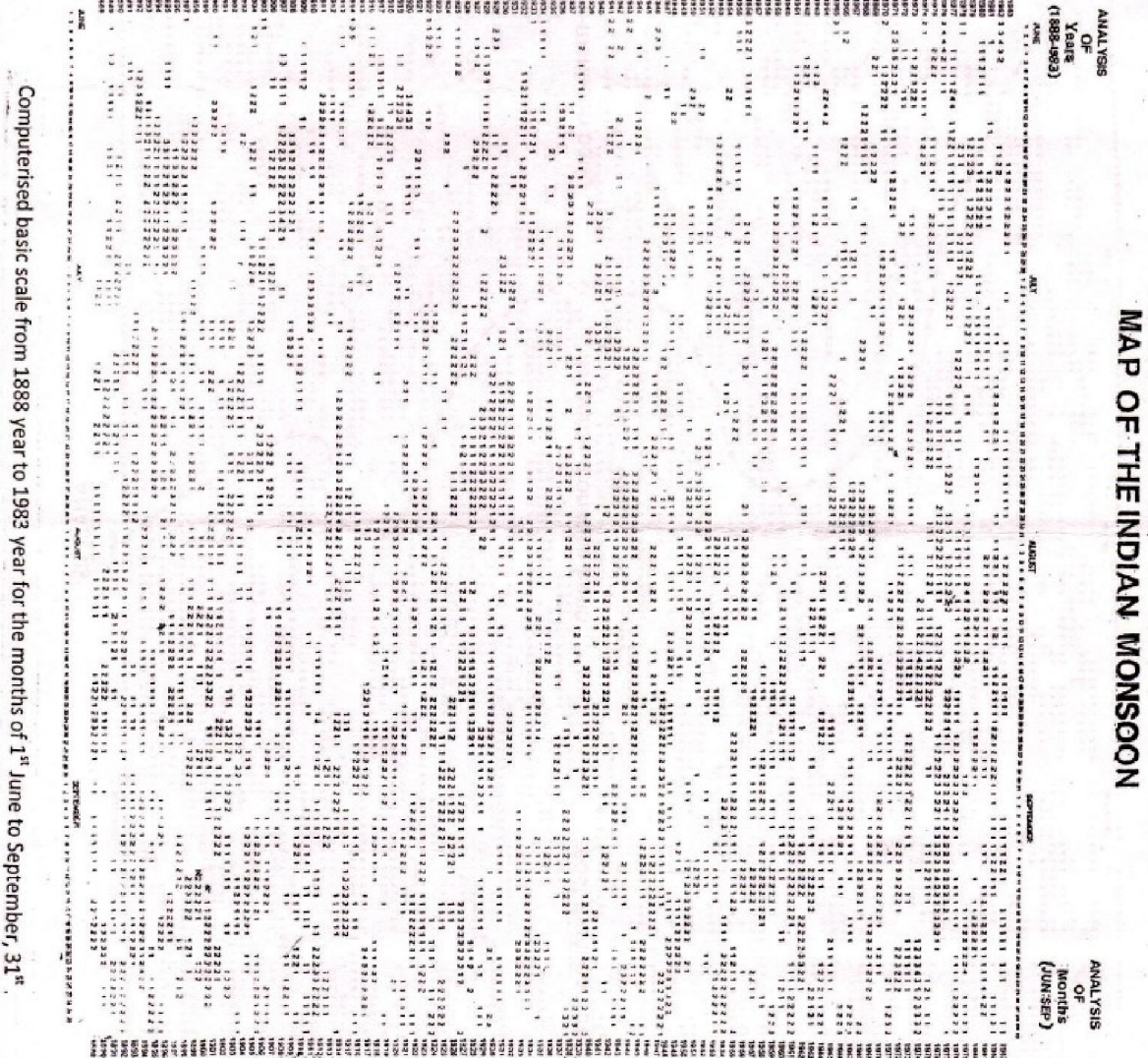
Computerised basic scale from 1888 year to 1983 year for the months of 1 st June to September, 31 st