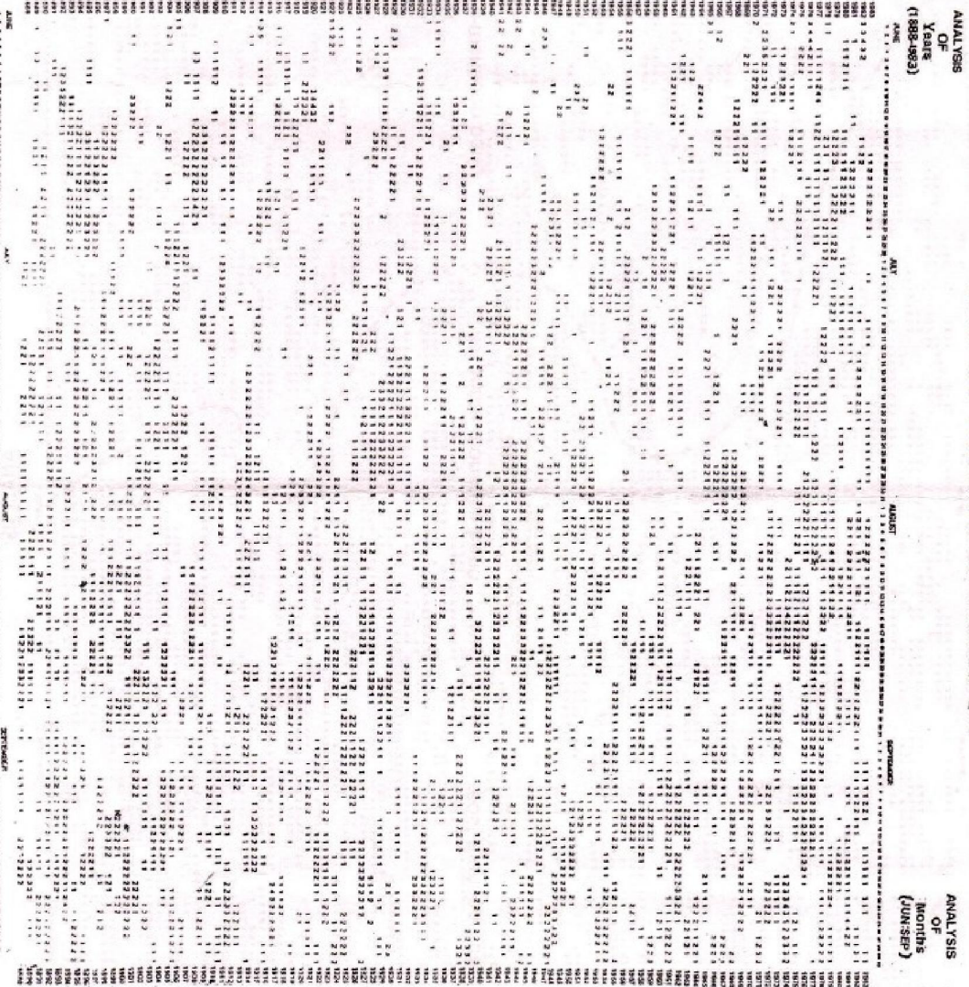
Computerised basic scale from 1888 year to 1983 year for the months of 1 st June to September, 31 st