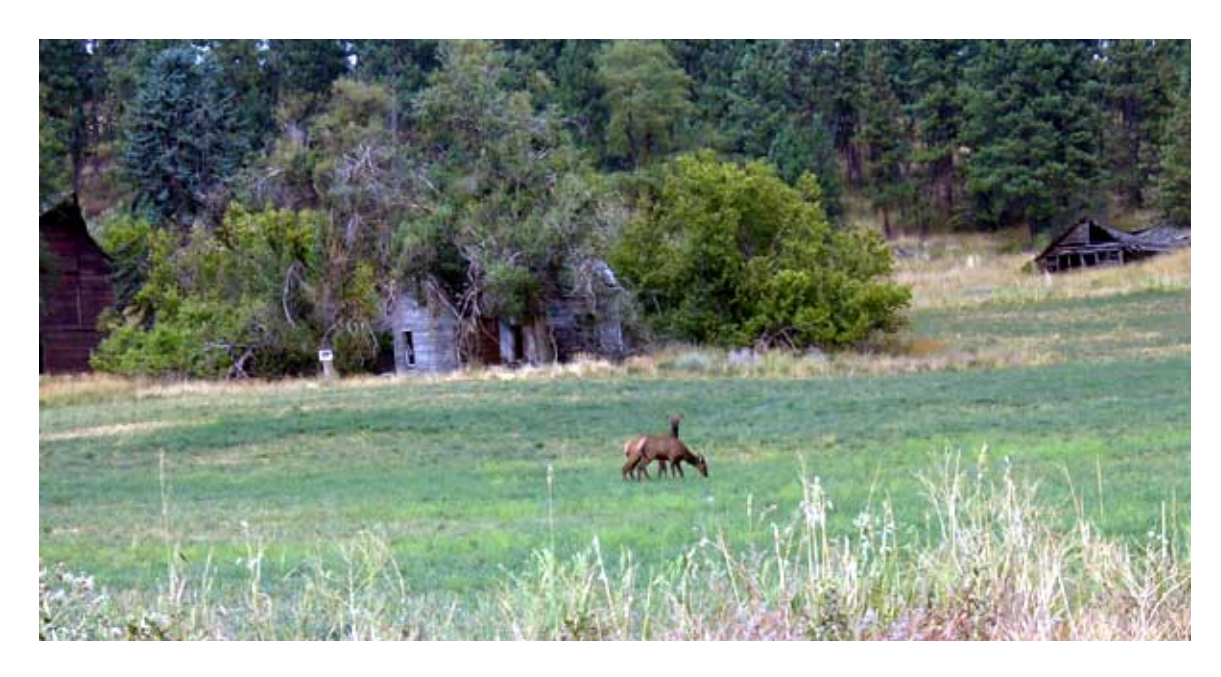
Fig. 1. Abandoning Farming will help in increasing Carbon Sink.