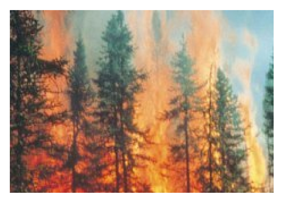
Fig. 3. Crown Fire in Canadian Boreal Forest.

There are numerous examples of severe forest fires due to EL NINO and the reverse LA-NINA effect, which occur in a periodic cycle of about 5-7 years in the pacific countries like Australia, Costa-Rica etc. Due to these horrible large-scale forest fires, the forest themselves become the sources of high CO2 emissions in the atmosphere, thus adding to the problem of global warming. So it is certainly not very much exciting to rely upon the terrestrial ecosystems for a future reliable source of Carbon Sink. Similar examples can also be taken from the northern boreal Canadian forests, which first of all do not sequester the atmospheric carbon in the desired amount and sometimes due to huge forest fires are transformed into big sources of atmospheric carbon ( Fig. 3 ).