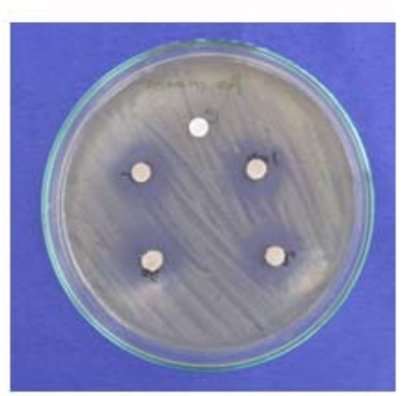
Fig. 2 Staphylococcus aureus

Fiho et al. (2002) found that hexane extract of gracilaria species (red algae) inhibits only bacillus subtiles in contrast our results showed that the methanol extract of kappa species (red algae) inhibited the bacterias, namely, pseudomonas fluorescence, staphylococcus aureus, vibrio cholera, proteus mirabilis.