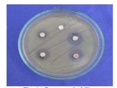
Fig. 4 Proteus mirabilis

For studies on the antibacterial activity of the extracts of the experimental brown algae, the five solvent systems used, namely, n-hexane, benzyne, ethyl acetate, methanol and the mixture of chloroform: methanol (2:1 v/v) were used. The bacteria staphylococcus aureus and E-coli were used as test organisms (Table 2). In this primary investigation, the algal extract