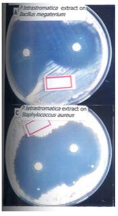
C. P. tetrastromatica extract on Escherichia coli

Values given in parentheses indicate % maximum activity