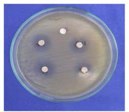
Fig. 3 Vibrio cholera

Fiho et al. (2002) found that hexane extract of gracilaria species (red algae) inhibits only bacillus subtiles in contrast our results showed that the methanol extract of kappa species (red algae) inhibited the bacterias, namely, pseudomonas fluorescence, staphylococcus aureus, vibrio cholera, proteus mirabilis.