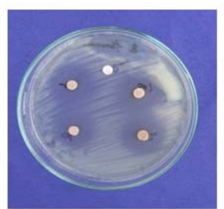
Fig. 1 Pseudomona fluorescences