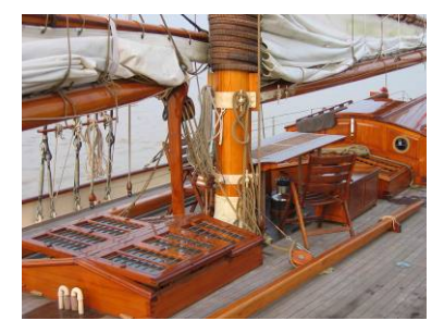
Figure.9 Hatch, Mast and Boom