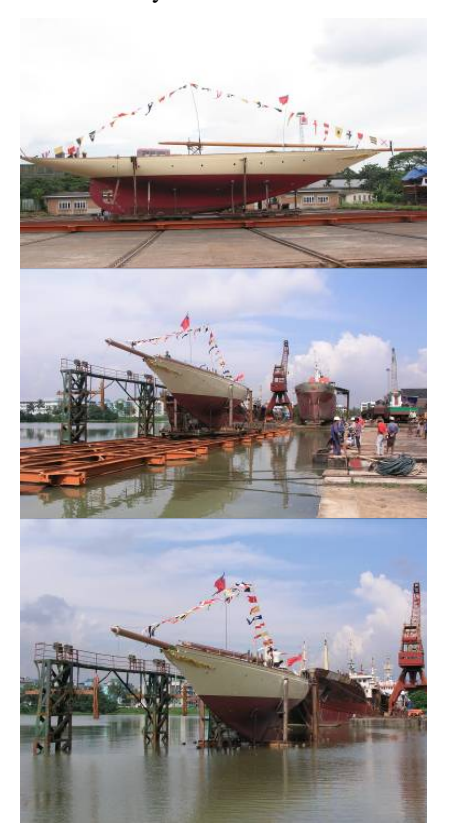
Figure. 6 Launching Processes

After fabricating the hull construction, it had to put on the cradle. Because of the high lightship draft, the cradle must be modified from 2 feet to 1 foot in high. After finishing of block assemblies, it was turned over and seated onto the modified cradles which were placed at the auxiliary side slipway. Before side shifting onto the small traverser, special side supports were provided because of having very steep in depth. Then it was released into the basin. Finally it was successfully launched on the day of 22-7-2002.