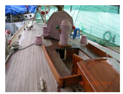
Figure.7 Deck floor

The interior design of the yacht was built almost entirely of teak wood. The interior which is hand crafted from teak and rosewood has been compromised from the original layout to allow for the required modern safety standards, such as the 4 watertight bulkheads. The deck is laid down in long thick lengths of solid teak planks over the steel frames, and caulked with cotton in the traditional way. The masts and spars are all of Sitka Spruce and the standing rigging is of galvanised steel.