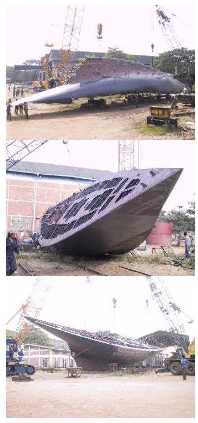
Figure. 5 Overturning Process

The hull turning was a social event and it was done in 12/22/2000. Leveling, alignment and dimensions were checked again. After making some temporary staging, some overhead welding were finished. The hull was pulled out along with the carriage and then lifted with cranes.