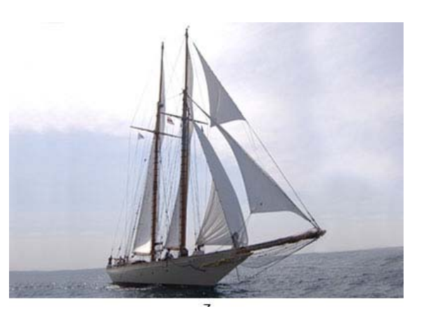
Figure.2 Schooner Sunshine