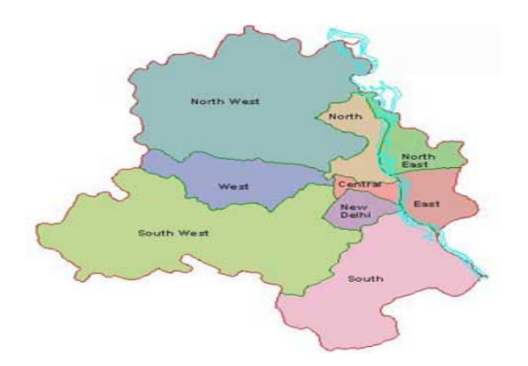
Figure 1. Map of Delhi (India)

The plant material of both species with the substratum was collected from various localities of Delhi (Fig. 1) during the month of September. The precise location of mosses with type of growth forms, the proximity to pollution sources and the nature of pollution sources were recorded on the spot. A population of the same species growing in the forested clean environment is taken as control. Samples were manually freed from solid litter, dust and other unwanted material. A jet of air was used to remove soil trapped on mosses. The specimens were dried in hot air oven for 24 hrs at 40°C. Five grams of material was taken and crushed with mortar and pestle. The soil and substratum to which moss species were adhered was stored in paper bags. The soil samples were oven dried, crushed and subjected to acid digestion. Estimation of the heavy metals in the plant samples as well as in the substratum was done by atomic absorption spectroscopy according to Allen (1989), using AAS ZEEnit 60/65.