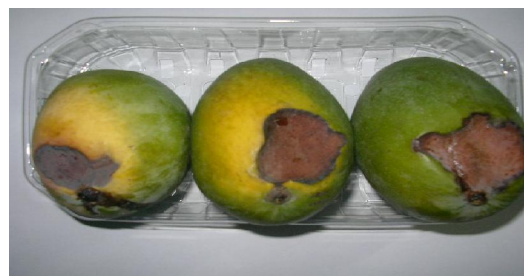
Figure 1, Anthracnose disease symptoms on mango fruits

Anthracnose, caused by Colletotrichum gloeosporioides (Penz.) Penz. And Sacc., is the major postharvest disease of mango in all mango producing areas of the world (Dodd et al. , 1997) and (Swart et al. , 2002). The disease occurs as quiescent infections on immature fruit and the damage it incites is more important in the postharvest period (Muirhead and Gratitude, 1986; Dodd et al. , 1997). Fungicides, either as preharvest or postharvest treatments, form the main approach to reduce losses from anthracnose. However, their use is increasingly restricted due to public concerns over toxic residues. Moreover, fungicides are unaffordable for many mango growers in developing countries (Dodd et al. , 1989).