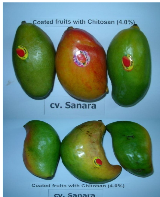
Figure 3, Effect of chitosan coating on anthracnose disease incidence of mango fruits cv.canara during storage period.