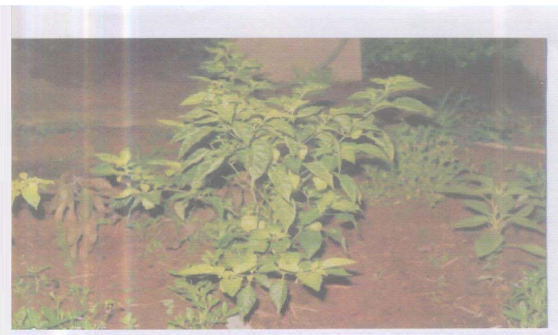
Fig 1a: Habit of Capsicum anum