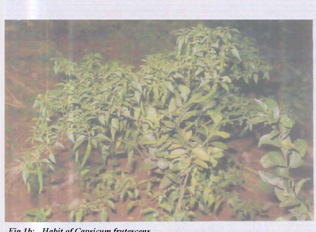
Fig 1b: Habit of Capsicum frutescens