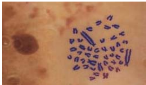
Fig.(2): Chromosome metaphase spread Of sarotherodon galilaeus