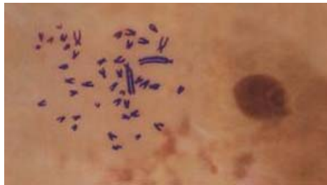
Fig.(1): Chromosome metaphase spread Of Oreochromis niloticus

In case of Tilapia zillii and Oreochromis niloticus ,the difference was in chromosomes numbers 6,8,11,14 and 21, they were longer in Oreochromis niloticus than T ilapia zillii . These results led to the probability of hybridization between Oreochromis niloticus and sarotherodon galilaeus ,but less chance between Oreochromis niloticus and Tilapia zillii .