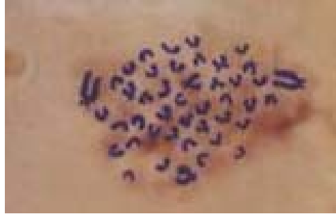
Fig.(3): Chromosome metaphase spread Of Tilapia zilli