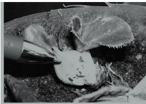
Figure 3. Bergenia stratcheyi showing bulb like structure.