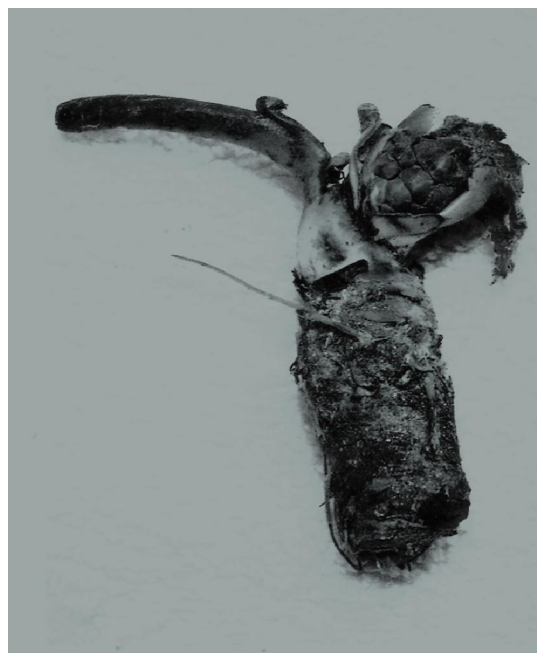
Figure 4. Bergenia ciliata showing floral primordia.