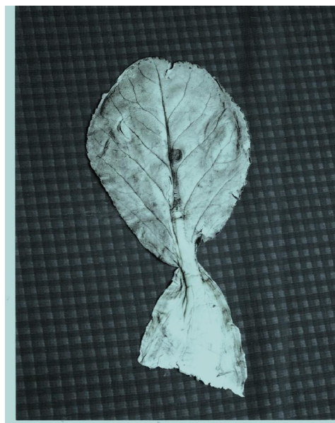
Figure 1. Bergenia stracheyi showing broad petiolar sheath.

iii. Bulb like structure (Fig.no. – 3) is also observed at the tip of the rhizomatous stem, which is the third interesting point seen in the said genus. This bulb like structure is floral primordia (Fig.no. – 4) which is covered by two petiolar sheaths. Bulb like structure developed in autumn (Oct. – Nov.) and remains upto early spring (Feb. – March). The petiolar sheath seems to be act as protective cover of floral primordia during adverse winter months.