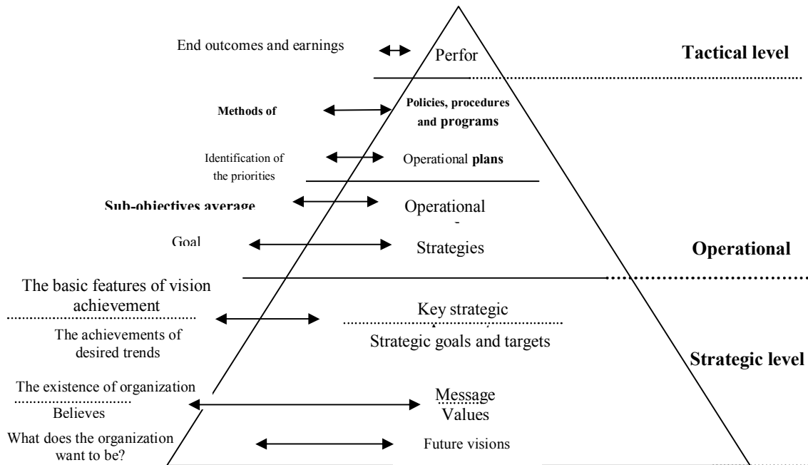
Fig (1) strategic planning process

The researchers will reflect strategic planning which covers various theoretical frameworks through a number of tables and figures to illustrate the different dimensions of strategic planning.