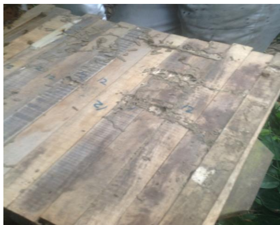
Figure 5: Termites' partially infested colonised hive

Small black hive beetles ( Aethina tumida ) were scantily observed in all hives during harvesting and one of the hives was partially infested with termites as shown in Fig. 5.