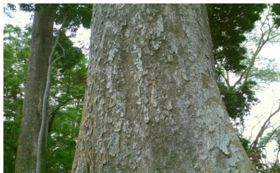
Figure 1: Sound Triplochiton scleroxylon tree of 1.47m DBH without hollow

Triplochiton scleroxylon is a tropical tree known as Obeche in Nigeria, Wawa in Ghana, Ayous in Cameroon and Samba in Ivory Coast. Its wood has a white colour and moderate texture that permits nailing both in green (wet) and dry conditions without causing pronounced split. One of the biggest T. scleroxylon encountered as shown in Fig. 1 during preliminary survey of wood species cavities preferred by honeybees in Nigeria was not vulnerable to hollowness and even at DBH of 1.47m while living unlike other white woods like Adansonia digitata , Bombax buonopozenze , Ceiba pentandra , Gmelina arborea , Vitex doniana etc which provide cavities and preferred by honeybees for nesting (Aiyeloja and Adedeji, 2014). Its non-proneness to hollowness might be an inherent genetic attribute and its selection as a suitable wood was based on colour, texture and availability in the lumber markets. Sound lumbers of 1x12x12 and 2x6x12 sizes were purchased from Ilabuchi lumber market in Port Harcourt. Fifteen Kenyan hives samples of 80cm length by 30cm in depth with 22 top bars (40cm length by 3.3cm in width) were constructed with used corrugated aluminium roofing sheets as covers. The hives were allowed to air-dry well because the wood has unpleasant odour in wet condition but disappeared as it seasoned.