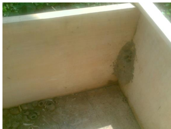
Figure 4: Small rats bedding materials and Wasp mound before colonisation