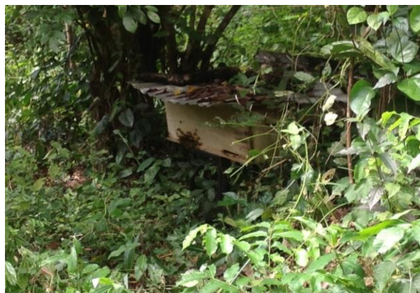
Figure 2: One of the colonised Triplochiton scleroxylon wood hives in the study area.