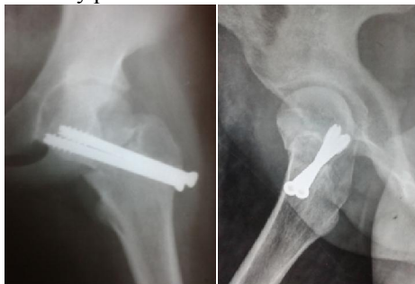
Figure 1: preoperative x-ray

The aim of surgery was to achieve Pauwels' angle from 25 to 30 degrees to bring the fracture site under compression with rigid fixation of both the original fracture and the osteotomy site to achieve sound union of the fractures. Surgery was done with the patient in supine position, under general anesthesia, using traction table and image intensifier. The skin incision was directly lateral and straight over the greater trochanter and proximal femur. The vastus lateralis was cut in L-shaped manner and elevated subperiosteally. For cases with non union due to fixation failure, the implants previously used to fix the neck fracture were removed; the fracture site was not exposed in any patient.