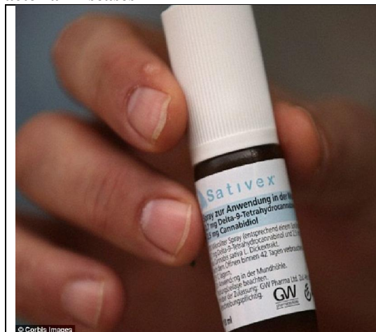
Product containing cannabinoids actively used against brain cancer treatment

Bacteria are present everywhere in the universe. There are many diseases which are caused by Bacteria and are a major threat for our life. Some common bacterial diseases are given below: