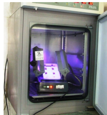
Fig (1) the incubator chamber demonstrate the UV-irradiation technique

The data obtained in this study were calculated and statistically analyzed, according to Student's t-test (Venables and Ripley, 2002), using statistical software.