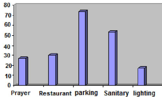
Chart 1: Classification of tourism problems according to tourist's views

Facilities in the region So that with respect to items on the questionnaire That considered 5 part of major tourism problems, Health tourists That have used the hot springs From the five sectors respectively, tourism problems in this area Has been ranking as following diagram.