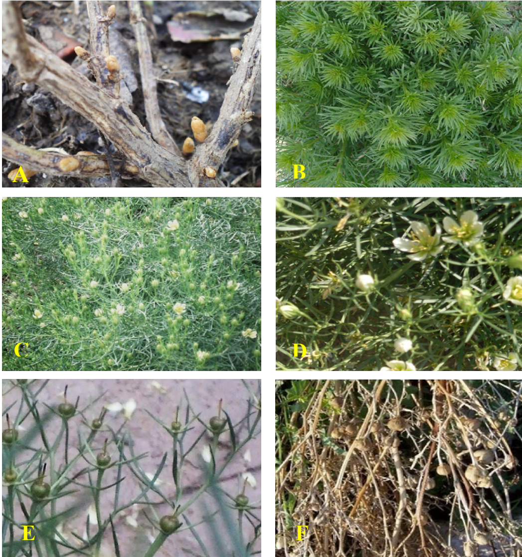
Plate 1: Different phenophases in Peganum harmala

The phenological events were monitored from sprouting of young shoots up to the senescence in all the selected populations. The phenological events studied include, initiation and duration of sprouting, initiation of sexual phases, anthesis, fruit development and senescence (Plate 1).