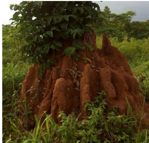
Figure 1: One of the Termitaria Prior to Sampling.

Compaction test was carried out to determine both the maximum dry density (MDD) and optimum moisture content (OMC). Both OMC and MDD values were not uniform for all termitaria as shown in Table 1. Variations in values occurred from one termitarium to the next in all the zones considered. The values of OMC obtained were used to prepared samples for shear strength and CBR tests.