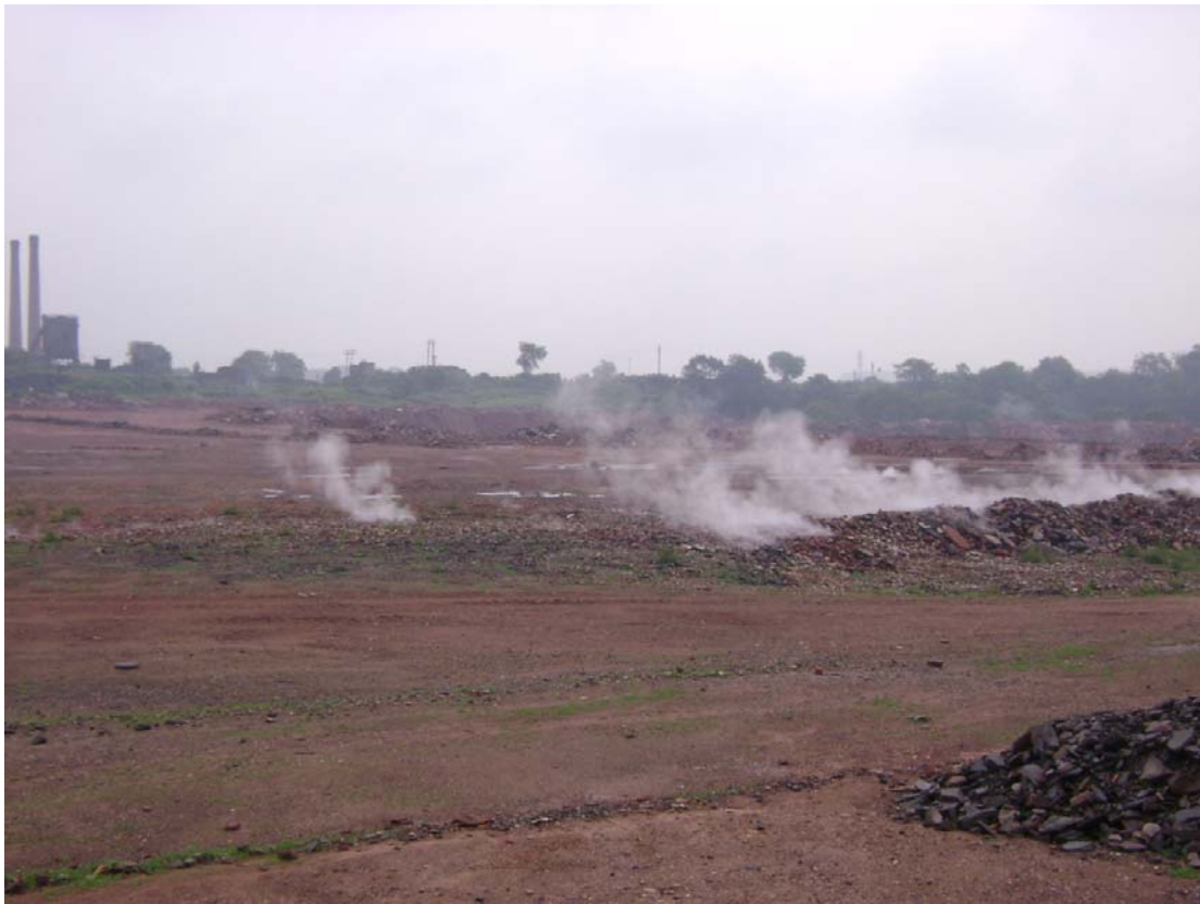
Fig 2 Fire affected area in Jharia coalfield