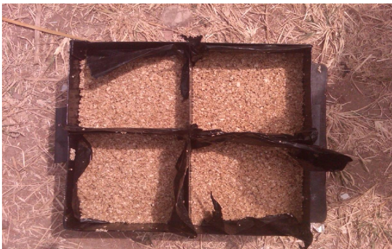
Plate 1: Sample of Produced Corncob Briquettes