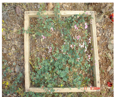
Fig 1. Lotus gebelia species.