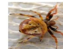
Neoscona Sp. (F- Araneidae)