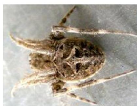
Neoscona Sp. (F- Araneidae)