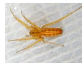
Larinia phytica Female (F- Araneidae)