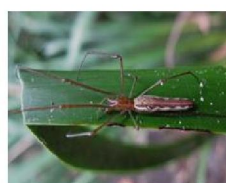
Tetragnatha sp. (F- Tetragnethidae)

1989). Uetz (1991) suggests that structurally more complex shrubs can support a more diverse spider community. Downie et al. (1999) and New (1999) have demonstrated that spiders are extremely sensitive to small changes in the habitat structure, including habitats complexity, litter depth and microclimate characteristics. Spiders generally have humidity and temperature preferences that limit them to areas within the range of their “physiological tolerances” which make them ideal candidates for land conservation studies (Riechert, Gillespie 1986). Therefore, documenting spider diversity patterns in this ecosystems can provide important information to justify the conservation of this ecosystem.