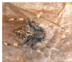
Neoscona Sp. (F- Araneidae)