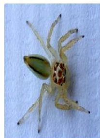
Telamonia Sp. (F- Salticidae)