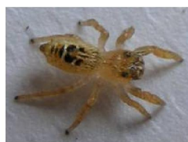
Thyene Sp. (F- Salticidae)