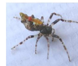
Cyclosa hexatuberculata (F- Araneidae)