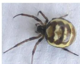
Zygeilla sp. Female (F- Araneidae)