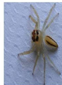
Telamonia Sp. (F- Salticidae)