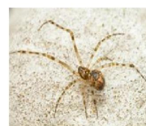
Theridion sp. (F- Therididae)