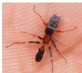
Myrmarachne sp. (F- Salticidae)