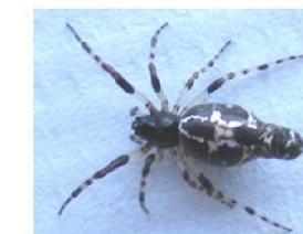
Cyclosa moonduensis (F- Araneidae)