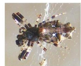
Cyclosa spinifera (F- Araneidae)