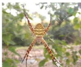
Argiope aemula (Female) (F- Araneidae)