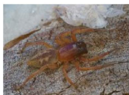
Clubiona sp. (F – Clubionidae)