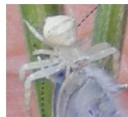
Thomisus Sp. (F- Thomisidae)