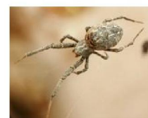
Uloborus Sp. (F- Uloboridae)

This is the first attempt in the central part of Madhya Pradesh. Spider Fauna were studied during the present study. No body has done work on such aspects. During the present investigation 44 species Identify out of 117 specimens were collected.