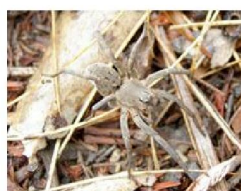
Hippasa sp. (F- Lycosidae)