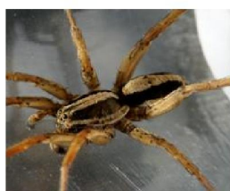
Hippasa sp. (F- Lycosidae)