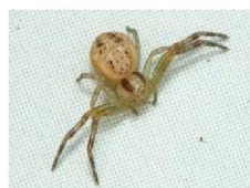
Xysticus sp. (F- Thomisidae)