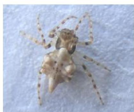
Cyclosa sp. (F- Araneidae)