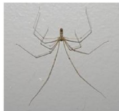
Pholcus Sp. (F- Pholcidae)

There are many environmental factors that affects species diversity (Rosenzweig 1995). However, when spiders were divided according to their functional group there was a significant effect of habitat on the diversity of these groups. The web building and foliage running spiders rely on vegetation for some part of their lives, either for finding food, building retreats or for web building. The structure of the vegetation is therefore expected to influence the diversity of spiders found in the habitat. Studies have demonstrated that a correlation exists between the structural complexity of habitats and species diversity (Hawksworth, Kalin-Arroyo 1995). Diversity generally increases when a greater variety of habitats types are present (Ried, Miller