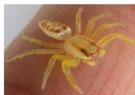
Marpissa (F- Salticidae)