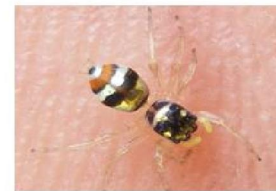
Phintella (F- Salticidae)