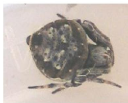
Neoscona Sp. (F- Araneidae)

No exceptionally poisonous spiders were found among the species recorded in the Narmada valley. The spiders are most abundant and ecological important they are exclusively carnivorous and hence help naturally to control insect pest agro-ecosystems and indicators.