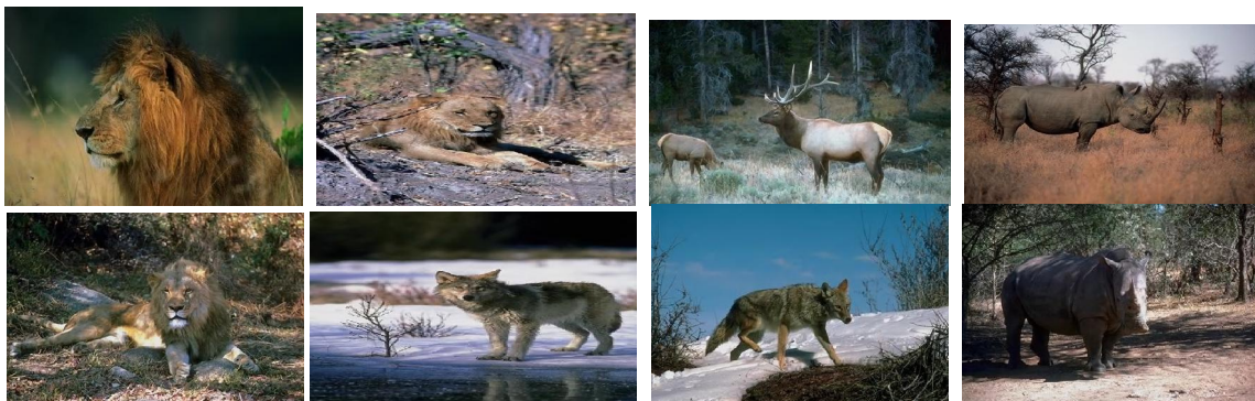
Figure 3 : result of complex wavelet