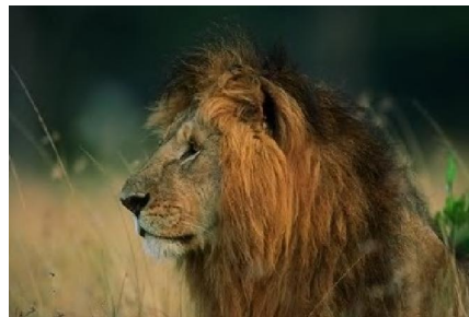
Figure 2 : query image

We test this method in image database include 5000 images of animals from Corel database. Comparing results by initial vectors and selected vector is presented below: