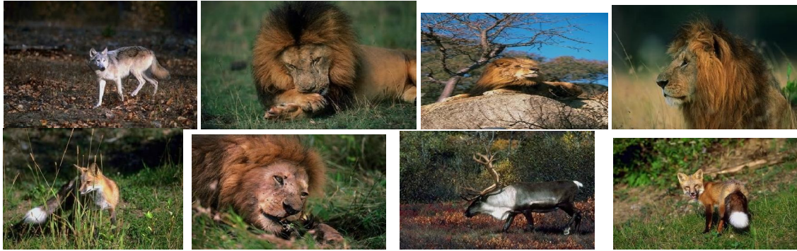
Figure 4: result of RG-BY-WB