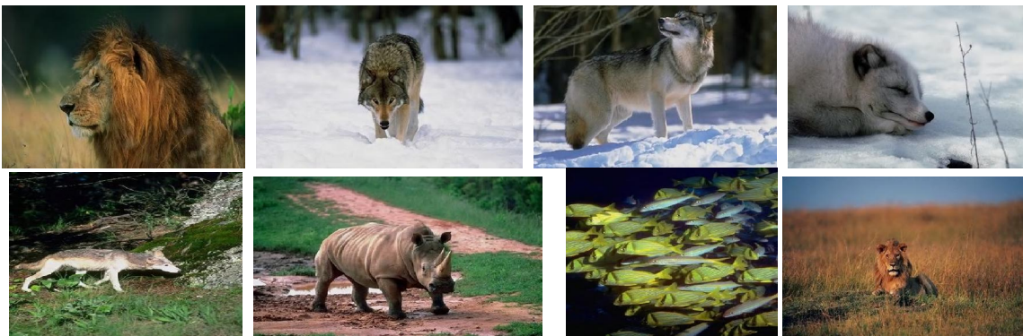
Figure 3 : result of 2d-wavelet