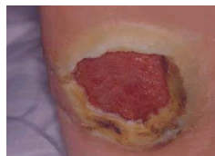
Figure 7: query image

This method can be used in medical science, especially in ulcer detection in patient's skin photos, because it can analyze the texture of images and detect patterns in them. In this way, we must get a higher weight to texture indices and then create selected vector. We use this vector in a database of images of patient's skin and run a query with a sample image. The result is shown below: