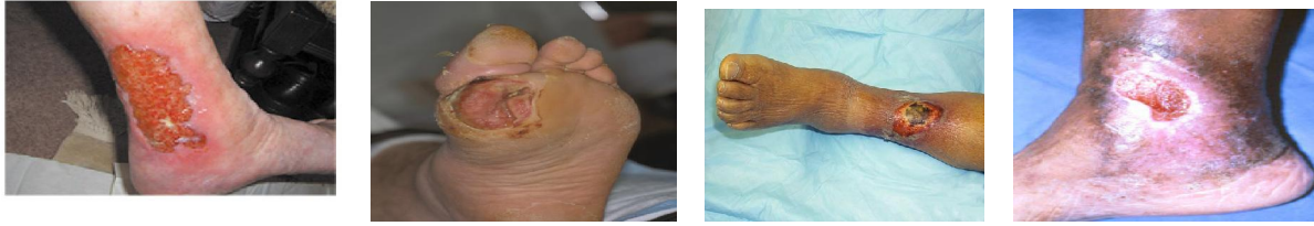
Figure 8: result of selected vector with high weight texture indices