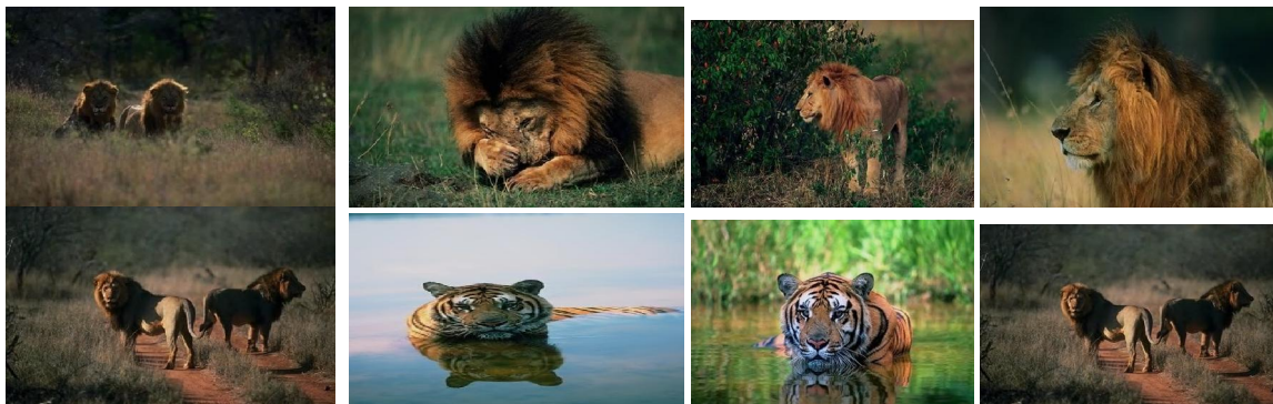
Figure 6: result of selected vector

This method can be used in medical science, especially in ulcer detection in patient's skin photos, because it can analyze the texture of images and detect patterns in them. In this way, we must get a higher weight to texture indices and then create selected vector. We use this vector in a database of images of patient's skin and run a query with a sample image. The result is shown below: