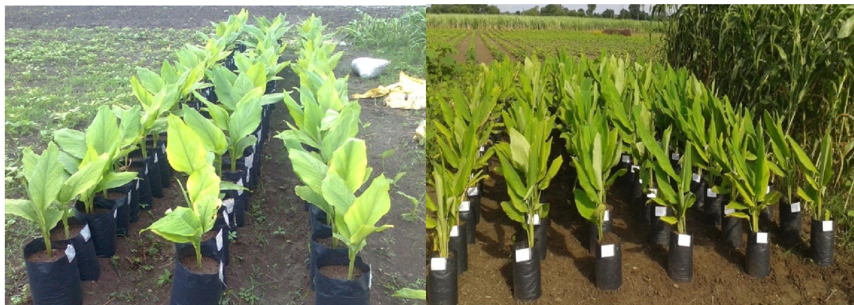
Fig. 1 showing cultivation of plants in necessary conditions in from of study area

Seed germination observation has been made and it consists of following pattern. First observation made after 45 days from the date of calculation on the date of 5 July 2011. Second observation has been made after 75 days on the date of 5 August 2011. In this way total 7 Observation made. During these 7 observation height of bark, height of plant and length of leafs determined with the help of measuring tape. Leafs, and foliage measured in numbers with the help of above measured in numbers with the help of above 5 methods and attempts has been made to study the growth of turmeric plant.