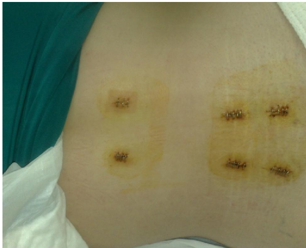
Figure (1): Post-operative skin clips for four tiny incisions for screws and another higher two for rod insertion in L4-5 level.

There is no long midline scar, as with the open surgery technique. Instead there are three tiny holes,