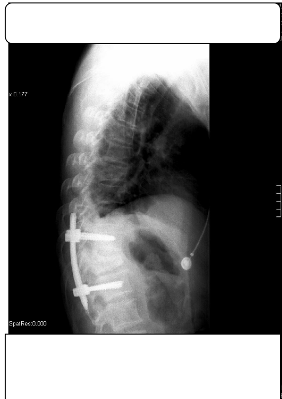
Figure (4): Post-operative percutaneous pedicle screws placement in dorsal spine.

a lower incidence rate of chronic lower back pain. 1 The current study is consistent with these observations.