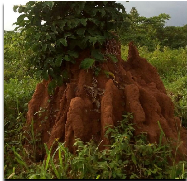
Figure 1: One of the Termitaria Prior to Sampling.

Compaction test was carried out to determine both the maximum dry density (MDD) and optimum moisture content (OMC). Both OMC and MDD values were not uniform for all termitaria as shown in Table 1. Variations in values occurred from one termitarium to the next in all the zones considered. The values of OMC obtained were used to prepared samples for shear strength and CBR tests.