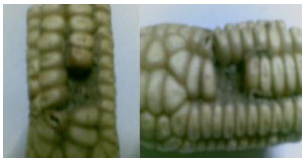
Figure 1. Infected maize samples

A total of 100 samples of maize were collected from different fields in Al-Dakahliya governorate, Egypt. These samples were kept at -4°C until Fusarium moulds were isolated and fumonisin B 1 analysis was carried out.