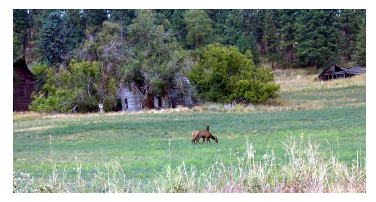
Fig. 1. Abandoning Farming will help in increasing Carbon Sink.

Provincial differences: Other aspects probably include changes in foliage, plant litter and soil microbes. These in turn are affected by changes in photosynthesis, respiration, fire and insect outbreaks, influenced by huge climate fluctuations such as El Nino and its reverse La Nina effect or more commonly ENSO ( El Nino Southern Oscillation ) in the pacific ocean . Growing trees soak up net quantities of CO_2 , and the higher levels of CO_2 and nitrogen in the atmosphere are themselves stimulating tree and plant growth.