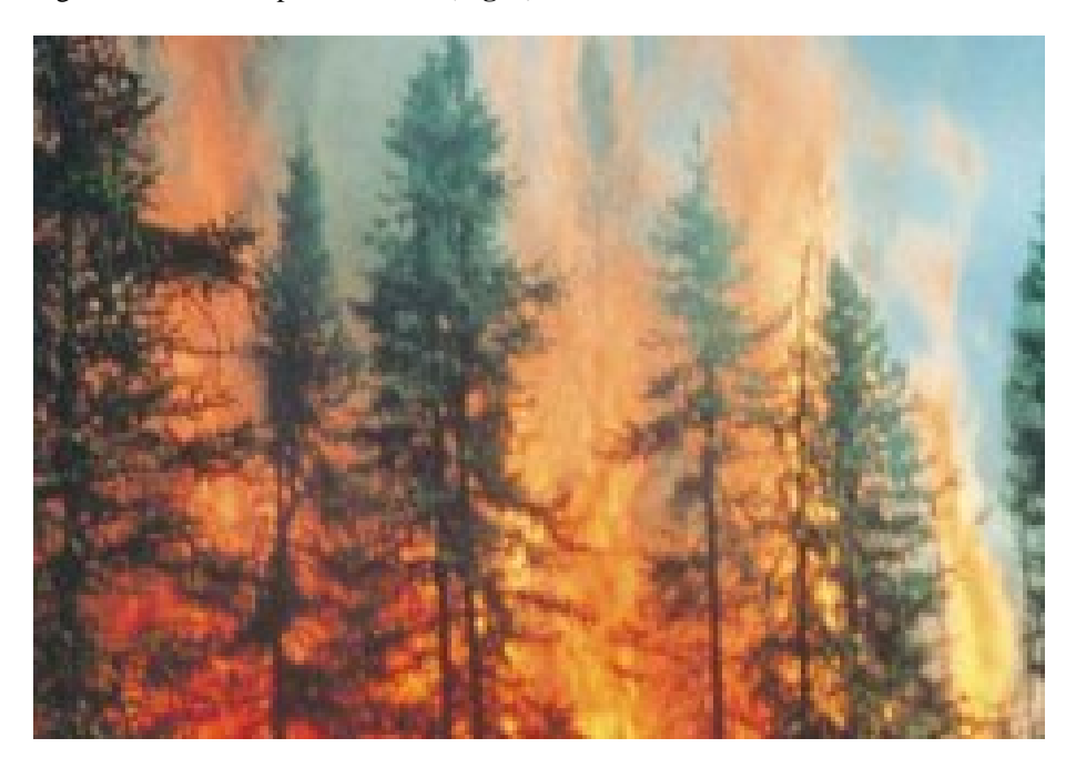
Fig. 3. Crown Fire in Canadian Boreal Forest.

There are numerous examples of severe forest fires due to EL NINO and the reverse LA-NINA effect, which occur in a periodic cycle of about 5-7 years in the pacific countries like Australia, Costa-Rica etc. Due to these horrible large-scale forest fires, the forest themselves become the sources of high CO2 emissions in the atmosphere, thus adding to the problem of global warming. So it is certainly not very much exciting to rely upon the terrestrial ecosystems for a future reliable source of Carbon Sink. Similar examples can also be taken from the northern boreal Canadian forests, which first of all do not sequester the atmospheric carbon in the desired amount and sometimes due to huge forest fires are transformed into big sources of atmospheric carbon ( Fig. 3 ).