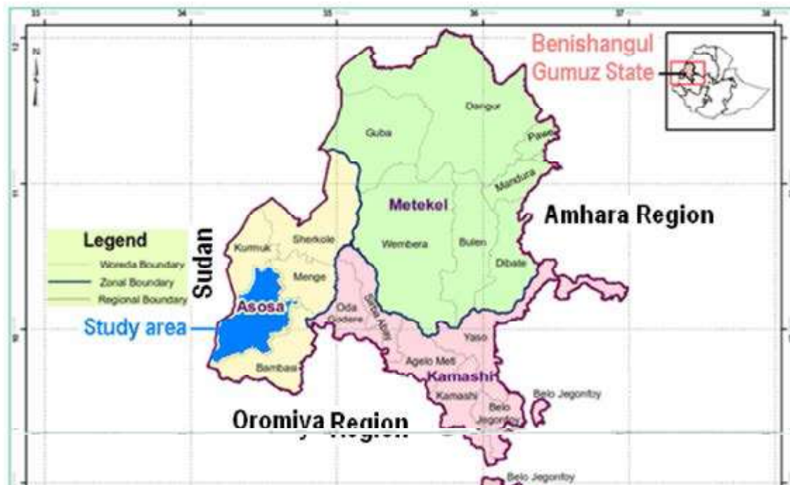
Figure 1: Administrative Map of Benishangul Gumuz.

The study was conducted in Asossa, which is located at 668Km North West of Addis Ababa. Asossa is the capital city of Benishangul-gumuz regional state located at 10° 04' north latitude and 34° 31' 59" east longitude. The altitude of the district ranges from 580-1500 meters above sea level and receives an annual rainfall of 900-1200mm with the mean minimum and maximum annual temperatures of 19°C and 34°C, respectively. The area has a sub humid climate with moderate hot temperature between daytime and night. The communities in the study area are rely predominantly on farming and cattle breeding.