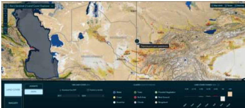
Figure 1. Living Atlas working interface.

In this study, Remote Sensing (RS) and Geographic Information System (GIS) methods were applied to identify Land Use and Land Cover (LULC) changes. Multitemporal satellite images from Landsat and Sentinel missions were analyzed, and datasets with low cloud cover were selected. Relevant data for the study area were collected through the Living Atlas platform ( https://livingatlas.arcgis.com/landcover/ ) and analyzed using ArcGIS 10.8.2 software (Figure 1). Prior to analysis, the satellite images underwent preliminary radiometric and geometric corrections to improve their spectral and spatial accuracy. .