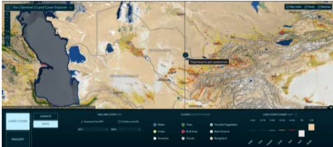
Figure 1. Living Atlas working interface.

During the analysis, the boundaries of the study area were defined, and a watershed delineation map of all river basins within the Fergana Valley was also created. In addition, foreign and domestic dissertations, research studies, scientific articles, and textbooks were reviewed, and the author's perspectives were formulated based on the analysis and synthesis of their findings.