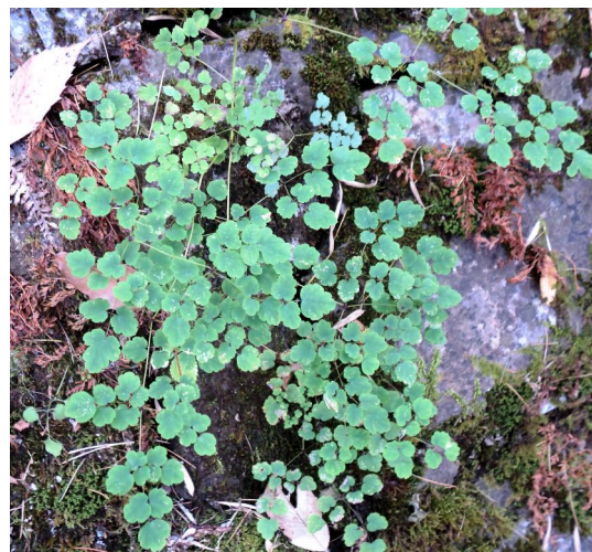
Fig 1: Thalictrum foliolosum

Thalictrum foliolosum , belongs to family Ranunculaceae, commonly known as "Meadow rue" in Kumaun "Mamira" widely distributed in climatically moderate zones of the Northern Hemisphere. It is a slow growing, dump forming, rhizomatous perennial plant (Fig 1). These like semi-shades, moist, well drained soil and very good for boarder plants and woodland gardens.