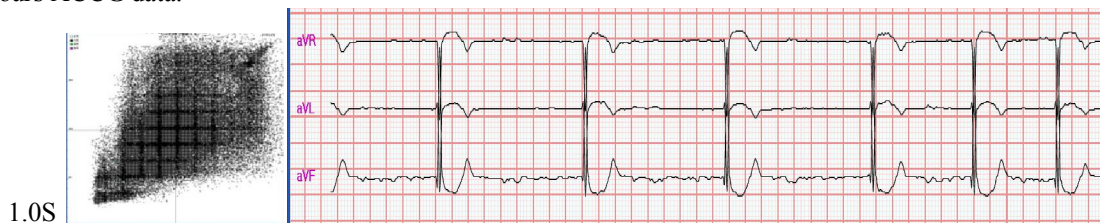
Fig.4-2: R_1-R_2 = R_2-R_3 = R_3-R_4=1.76s , junctional escape beat caused from the 2nd degree atrioventricular block.

1.0S Fig.3-1: Patients with persistent AF, R-R < or > 1.5s , the stalk strawberry shaped Lorenz Plot was drawn From 24 hours ACCG data.