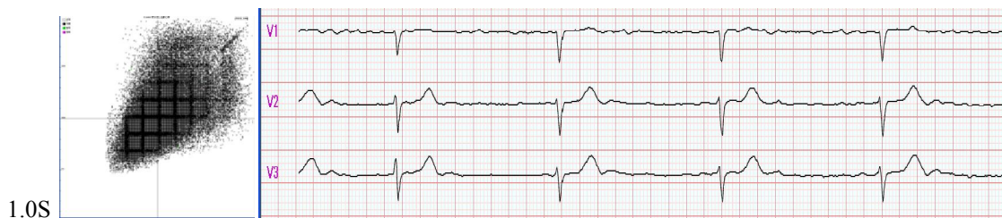
Fig.6-2: R_1-R_2 = R_2-R_3 = R_3-R_4 = 1.85s , junctional escape beat caused from the second degree atrioventricular block, that is the patient's longest escape beat interval, but is also the slowest mean rate of VR mean, that is 33/ Min.

Fig.6-1: Patients with persistent AF, R-R \leq \text{或} > 1.5s , the "strawberry shape" Lorenz were drawn from 24 Hours ACCG data.