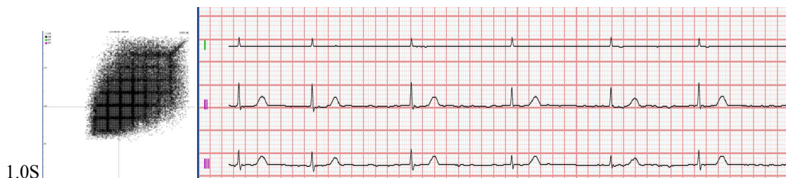
Fig.5-2: R_2-R_3 = R_3-R_4 = R_4-R_5=1.7s , junctional escape beat caused from the Second degree atrioventricular block.

Fig.4-1: Patients with persistent AF, R-R \leq or > 1.5s , the "strawberry shaped" Lorenz were drawn from 24 Hours ACCG data.