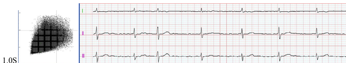
Fig.1-2: From Group A, The Longest R 3 -R 4 =1.32s, R-R never equal, all of the R-R Interval is less than 1.5s.

3.1.1. The "No Stalk Strawberry Shaped" Lorenz Plots found from 24 hour AECG data in Group A (17/98) and Group B (75/98) ; The patients with persistent Atrial fibrillation (Fig. 1-1, Fig. 2-1). The AECG data identical characteristics of group A and B showed that there is no equal R-R interval and no two degree atrioventricular block occurred. Yet, the different characteristics showed that there was the all of R-R interval in group A to be less than 1.5s, but that there was the R-R interval in group B partially to be less than the 1.5s (Fig.1-2), and in group B partially to be also greater than 1.5s (Fig.2-2).