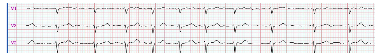
Fig.6-4: junctional escape beat caused from the second degree atrioventricular block, The VR is 96/minute to be the fastest mean rate of VR.