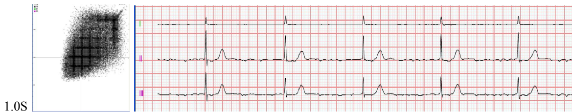
Fig.3-2: R_2-R_3 = R_3-R_4 = R_4-R_5=1.76s , junctional escape beat caused from the Two degree atrioventricular block.

interval happened between the junctional escape beat that caused by the two degree atrioventricular block in Group C too, but that there is not occurred in Group A and B (Fig. 3-2, 4-2, 5-2, 6-2, 3, 7-2, 8-2). There is R-R interval to be either greater than or less than 1.5s (Fig. 3-2, 4-2, 5-2, 6-2, 7-2, 8-2) in Group C, that is same Group B.