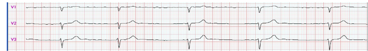
Fig.6-3: R_2-R_3 = R_3-R_4 = R_4-R_5 = 1.66s , junctional escape beat caused from the second Degree atrioventricular block, That is the patients with the shortest escape beat interval.

Fig.6-1: Patients with persistent AF, R-R \leq \text{或} > 1.5s , the "strawberry shape" Lorenz were drawn from 24 Hours ACCG data.