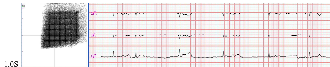
Fig. 8-2: R_2-R_3 = R_3-R_4 = R_4-R_5 = 1.80s , junctional escape beat caused from the Second degree atrioventricular block. 1.0S Fig.8-1; Patients with persistent AF R-R \leq \text{or} > 1.5s , the Stalk strawberry shaped Lorenz were drawn From 24 Hours ACCG data.