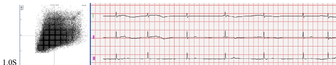
Fig.7-2: R_3-R_4 = R_4-R_5 = R_5-R_6 = 1.56s , junctional escape beat caused from the Second degree atrioventricular block. 1.0S Fig.7-1; Patients with persistent AF R-R \leq \text{or} > 1.5s , the Stalk strawberry shaped Lorenz were drawn From 24 Hours ACCG data.