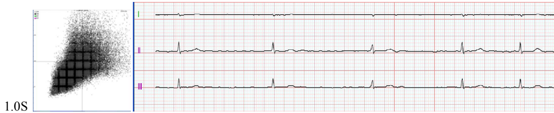
Fig. 2-2: The Longest R_2-R_3=1.96s , R-R never equal, R_4-R_5 interval to be less Than 1.5s .

1.0S Fig.2-1: Patients with persistent Atrial fibrillation, R-R \leq or > 1.5s , the all of R-R interval < 1.5s , the "No Stalk Strawberry shaped" Lorenz Plots were drawn from 24 hours AECG data.