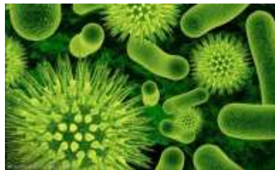
This is a germ

The third picture is the coronavirus, which may be the Wuhan Virus Research Institute. I'll download it to study it. Look at the first fruit and the fourth picture are the internal structure of the new pneumonia virus. It's the same as the internal eccentric system structure of the above elliptical diagram. Because the ellipse was discovered 40 years ago when I invented the eccentric vortex engine, I drew a sketch and wrote it in the comprehensive discussion on unified field theory published in the