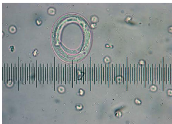
Figure 2; Embryonated egg of Parafilaria bovicola (light

(HE, 1000x).