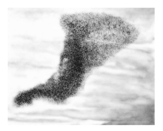
Fig. 1 Graphical example of a stylized flock having quasiness of multiple complex behaviours.